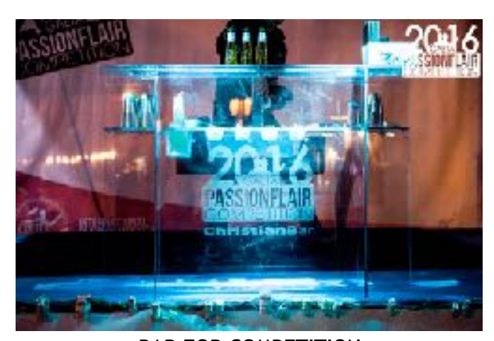
BAR FOR COMPETITION